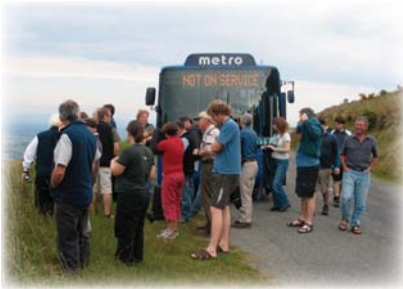
Te Waibora field trip - stop at Coopers Knob looking over Lake Ellesmere (Te Waibora)

The other standout feature for me was how relatively relaxed our Association is. The AGM was finished so fast that some NZARMers were on their 3rd beer before the other two societies had finished their AGMs.