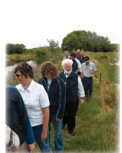
Walking alongside Hart's Creek to the bird hide