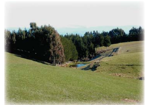
Pond in an ephemeral water course. Multi-functions – stock water, down-stream water quality, biodiversity, recreation, aesthetics.

Such areas are very evident in many gully situations. The multi-functional farm management benefits provided by structures such as trees placed in such areas can include: