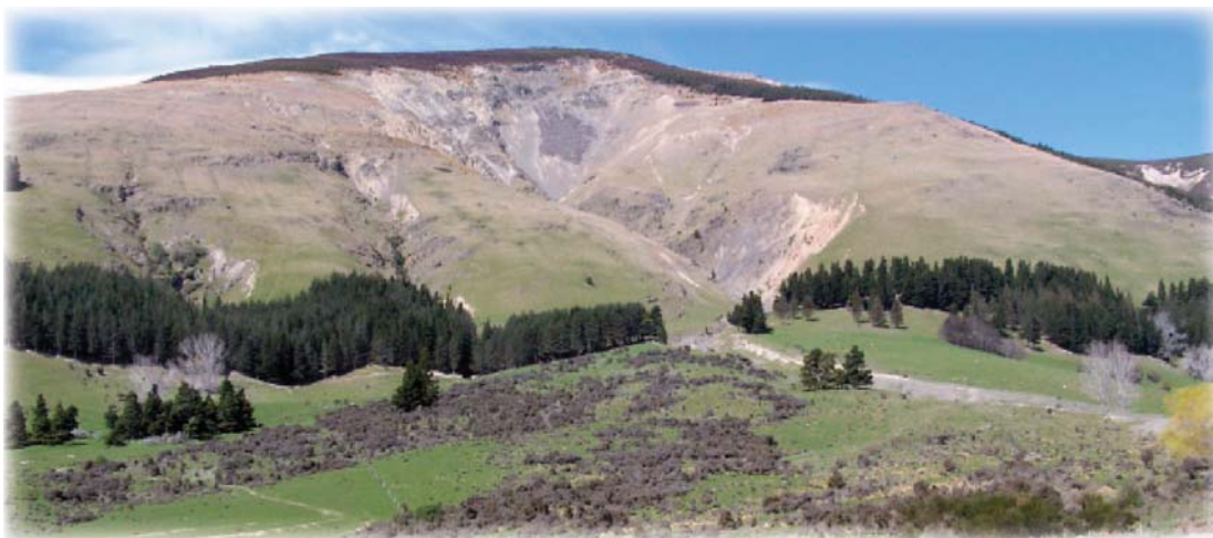
Commercial forestry woodlots in some South Island location. While still seen as a bit of an oddity by most farmers (we're farmers not foresters!), farm forestry may become more prevalent in the future if ever our Kyoto obligations are taken seriously. Growing trees for carbon sequestration & credits makes forestry that little bit more viable, and given the balance between high land prices and not-so-far off production limits, then we could perhaps see more of the smarter farmers strategically giving their marginal country greater consideration as a forestry producing resource.

Ewan is a Hawkes Bay Regional Councillor and an active farm forester.