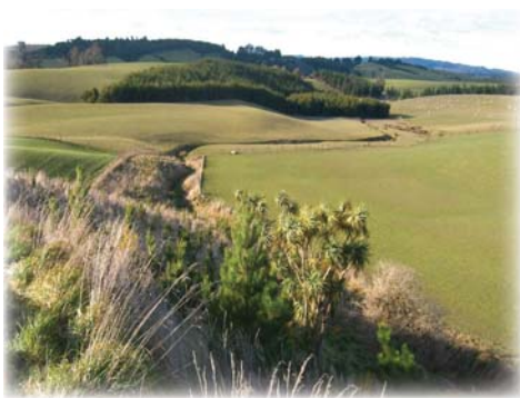
Southwest bank – a problem area for stock management & complementary soil, water & biodiversity values

Achieving the potential requires an understanding of patterns and processes in the farm system. These potentials are harder, or impossible, to understand or realise when the focus of research, policy and practice is on differentiation, analysis, specialist treatment away from a particular and broad farm context, and a focus on mechanical production alone. Effective science, policy and practice requires the ability to integrate and synthesis broader aspects affecting land management within the system, as well as analysis within particular contexts.