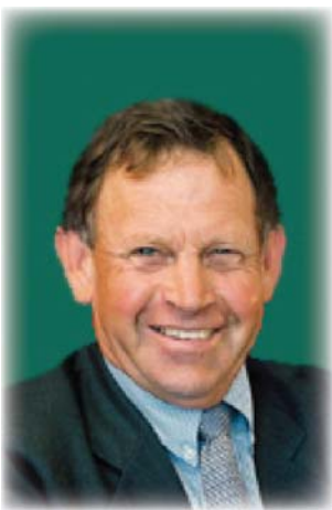
Ewan McGregor is a Hawkes Bay Regional Councillor and Chairman of the NZ Landcare Foundation.

In 1997 however the Government established the NZ Landcare Trust, also inspired by the Australian model, with modest levels of public funding. Its brief was to assist rural land owners to carry out environmental good practice on their properties. Like the Australians, it regarded landcare groups as the primary vehicle.