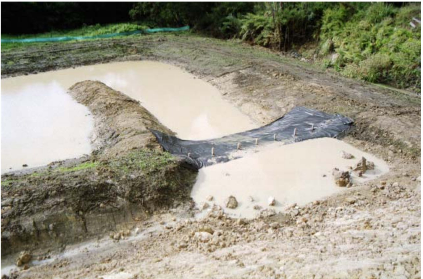
Sediment Control pond - Auckland