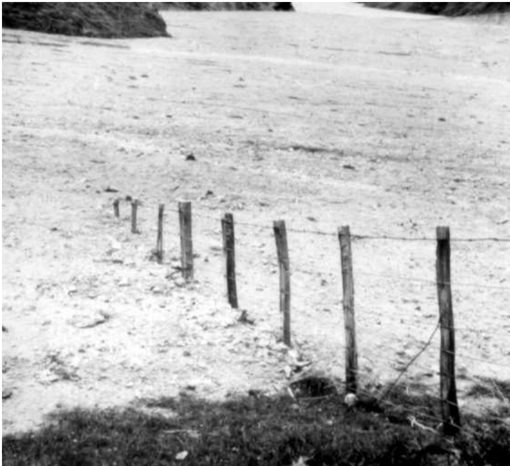
One of those old East Coast historical photos

Research, by MfE, DoC, and Local Government New Zealand, into New Zealand's biodiversity on private land has shown that more than 146,000 hectares of New Zealand's total land area is protected by covenants on private land, which is great! Central and local government have also been playing their part by providing approximately $5 million each to contestable funding for biodiversity in 2002/03. This highlights the great job local government is doing in protecting biodiversity on private land.