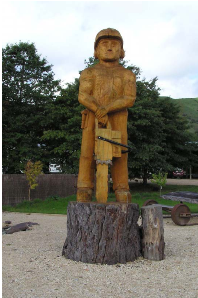
Art meets foresty – Outside Tapawera tearooms