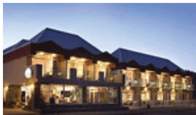
White Morph Motor Inn 92-94 The Esplanade Kaikoura

White Morph Motor Inn offers some of the best accommodation in Kaikoura including luxury spa rooms, superior studios and standard studios. Our central Kaikoura accommodation is all in the one place and has every accommodation style for you to choose from. It is our tradition to provide guests with quality service and warm hospitality, located on the Kaikoura waterfront. All rooms are fully equipped for your every need - non-smoking and fully fire protected for a reassuring sleep. All our rooms are Qualmark rated. Our luxury spa rooms are Qualmark 5 star and command full views of the ocean and mountains.