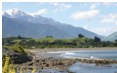
Dusky Lodge 67 Beach Road Kaikoura

Distance from hall: (400m) 4 minute walk