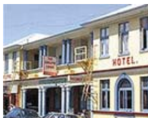
Adelphi Lodge 26 West End Kaikoura

Distance from the hall: (1.4kms) 17 minute walk