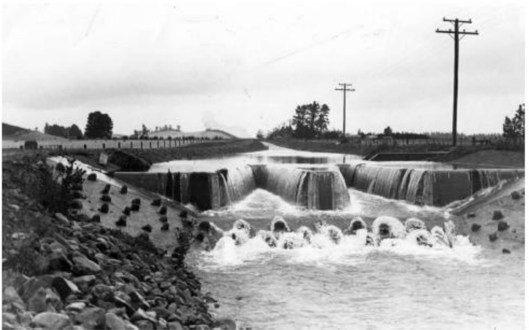
A weir on the main race of the Waiau Irrigation Scheme taken in 1981.