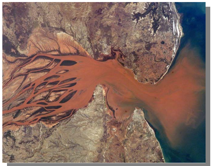
Sediment laden drainage, Betsiboka River, Madagascar. Looks like they could use a few poles.