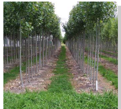
Saving the hill country one pole at a time at Akura Conservation Nursery