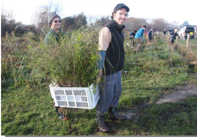
Your intrepid editor helps shoulder the load with the community.